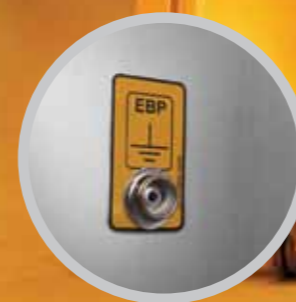
ESD GROUNDING POINT